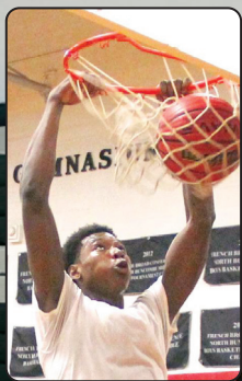
High School Camper - Dunking