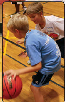
Elementary Camper - Defense