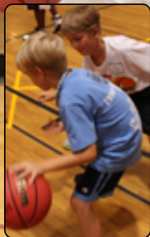
Elementary Camper - Defense

Players from Crossfire Camps over the last 30 years have gone on to compete at the collegiate and university level and some are now coaching in high school and college, as well.