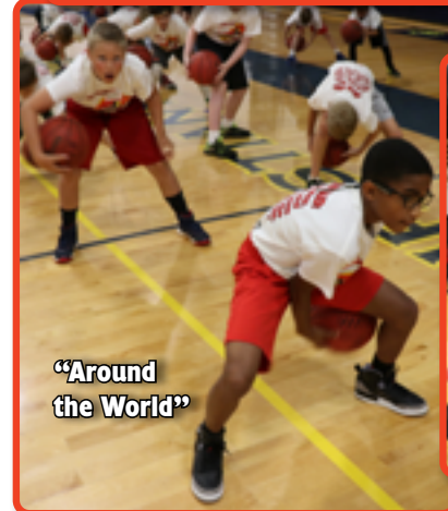
"Around the World"