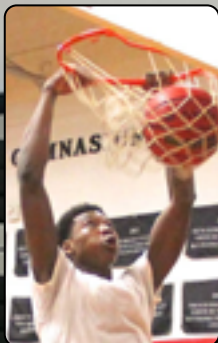
High School Camper - Dunking