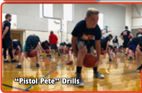
"Pistol Pete" Drills