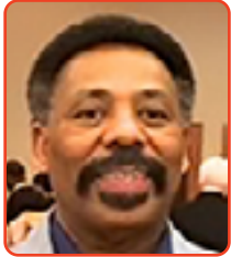
Dr. Tony Evans