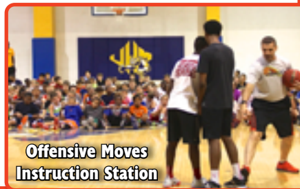
Offensive Moves Instruction Station