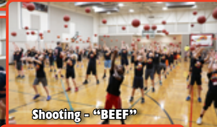
Shooting - "BEEF"