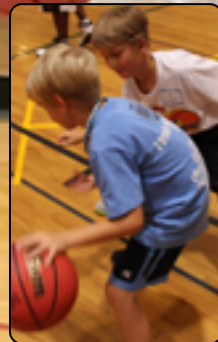
Elementary Camper - Defense

Players from Crossfire Camps over the last 30 years have gone on to compete at the collegiate and university level and some are now coaching in high school and college, as well.