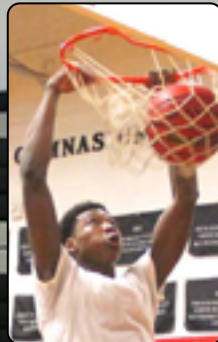
High School Camper - Dunking