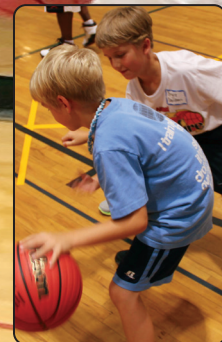
Elementary Camper - Defense

Players from Crossfire Camps over the last 30 years have gone on to compete at the collegiate and university level and some are now coaching in high school and college, as well.