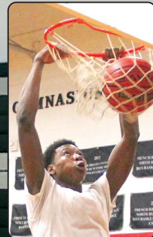
High School Camper - Dunking